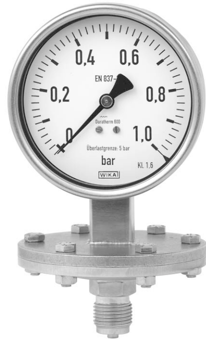
Diaphragm Pressure Gauge Model 432.50